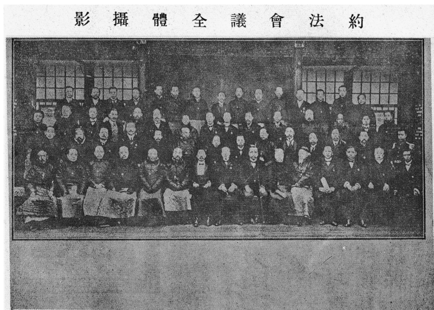
Figure 1.3 Yuefa huiyi quanti sheying [Group photo of the Constituent Assembly]. Dongfang zazhi 東方雜誌 11, no. 2 (Minguo 3 [1914]).

formed the Provisional Government during the Revolution of 1917, while a universally elected omnipotent parliament – the All-Russian Constituent Assembly – was supposed to resolve the Russian imperial crisis, which inter alia manifested in the disastrous First World War (1914–1918). At the same time, parallel to the institutions of the Provisional Government and the new zemstvo and municipal authorities, which were reformed on the basis of universal suffrage, the soviets (“councils”) reemerged (after their brief appearance in the Revolution of 1905–1907) as the bodies of class self-government. Although this situation was frequently interpreted as “dual power,” some socialists and liberals in fact viewed the soviets as “legislative chambers of deputies” and the Petrograd Soviet as “a surrogate people’s duma ,” which replaced the State Council in a two-house parliament of new Russia. 107