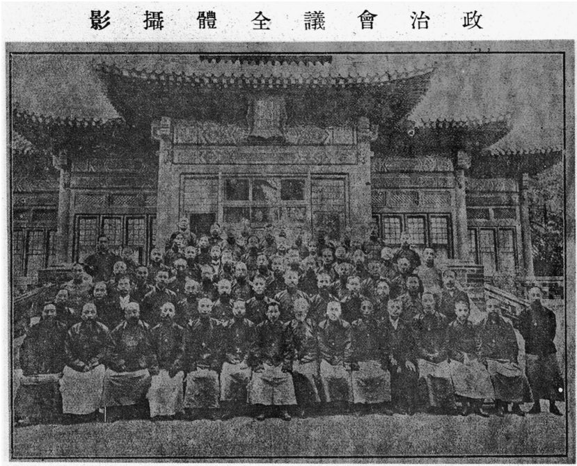
Figure 1.2 Zhengzhi huiyi quanti sheying [Group photo of the Political Assembly]. Dongfang zazhi 東方雜誌 11, no. 2 (Minguo 3 [1914]).

constitutional design conformed to the recommendations given to him by advisors such as Ariga Nagao and Frank Johnson Goodnow. Hence, these institutions also reflected a current of contemporary constitutional scholarship which accorded a powerful position to the head of the executive, regardless of whether he be an emperor or a president. 102