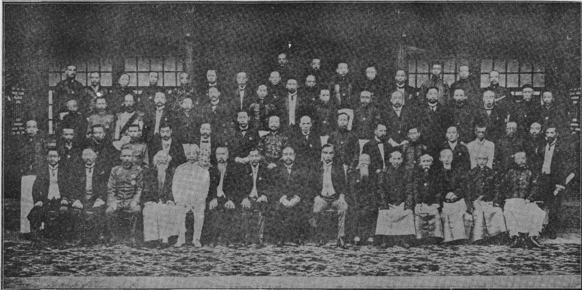
Figure 5.3 Canzhengyuan quanti sheying [Group photo of the Political Participatory Council]. Dongfang zazhi 東方雜誌 11, no. 2 (Minguo 3 [1914]).